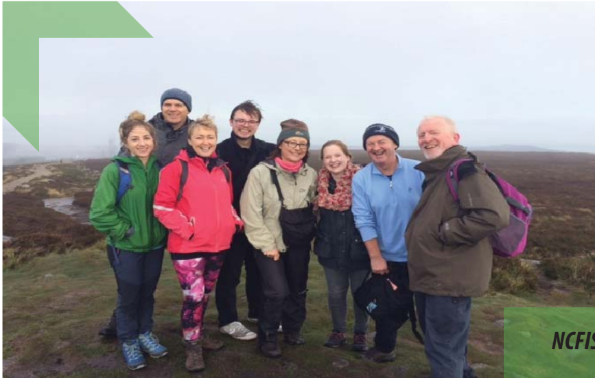
NCFIS Researchers' hike in the Dublin Mountains